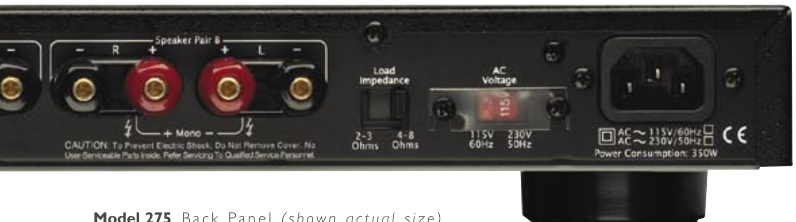
Model 275 Back Panel (shown actual size)

For more Model 275 information & its owner's manual, please visit www.parasound.com .